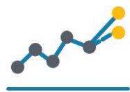
Time Series Prediction